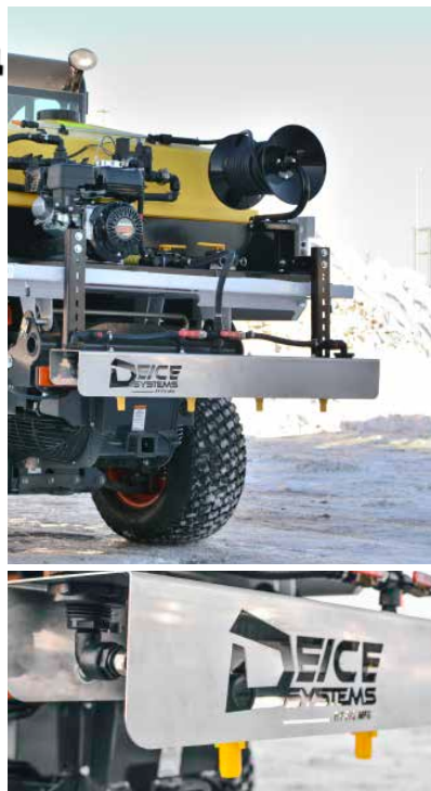
*FSDAK-100-EC SHOWN WITH FSDEICE-BOOM-4

DE-ICE SYSTEMS BOOM OPTIONS SEE PAGES 22-23