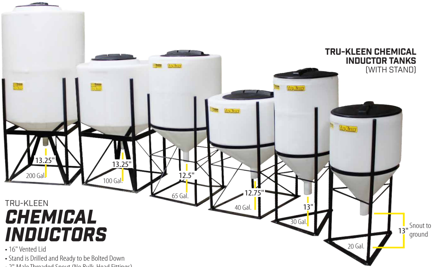
TRU-KLEEN CHEMICAL INDUCTOR TANKS (WITH STAND)